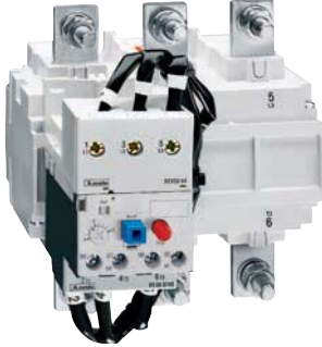
RFN200... - RFN420...