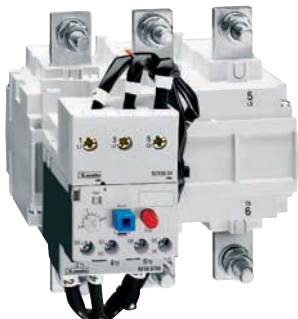
RF200... - RF420...