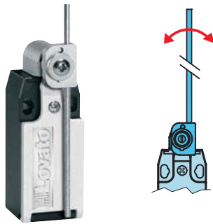
KB L... - KM L...