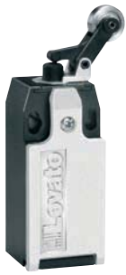
KB D... - KM D...