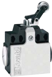
KC D... - KN D...