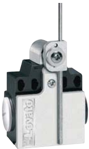
KC L... - KN L...