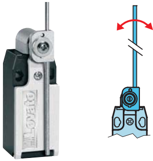
KB L... - KM L...