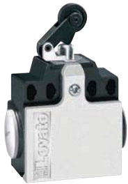
KC C... - KN C...