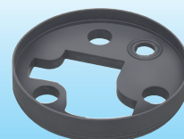
Optional Rubber Gasket SZ-200A